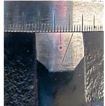
Latitude set point