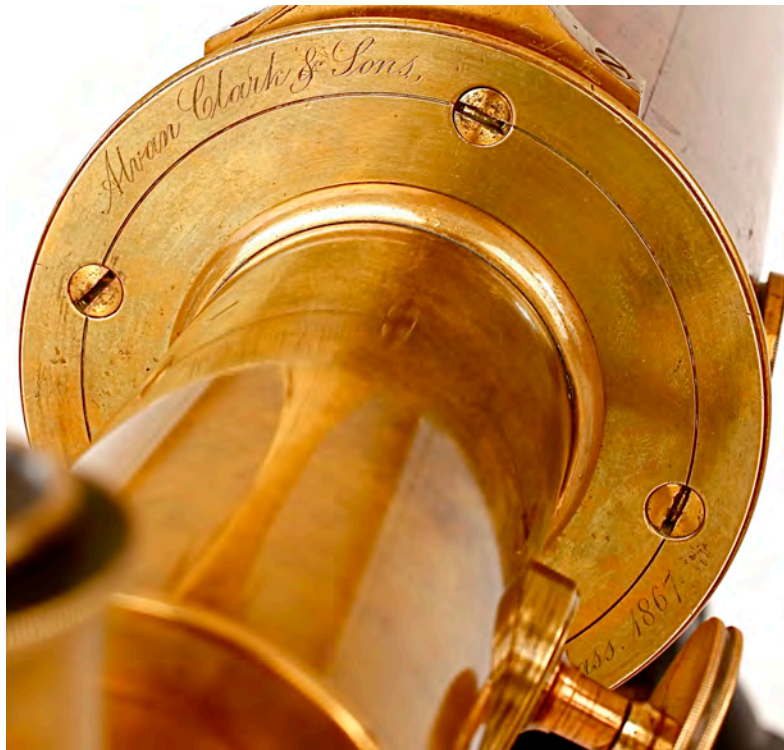
FRA14 Faceplate Alvan Clark and Sons Refracting Telescope 1867.