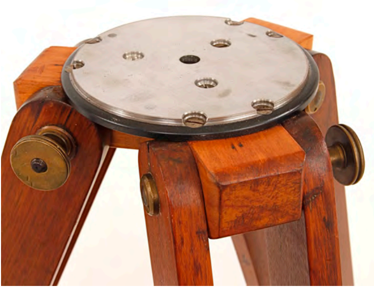
New plate in place and rim painted satin black