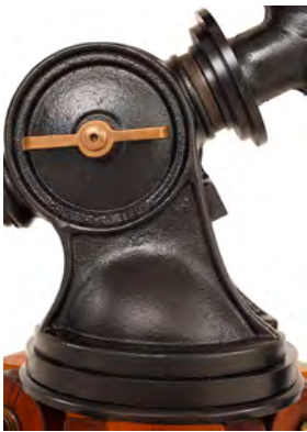
Lundin No.5 mount on tripod