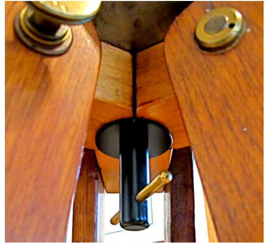
View underneath showing function of flange and new longer keeper bolt